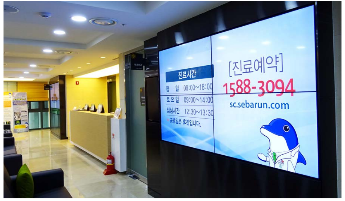
A 2x2 grid video wall is displayed in a waiting room of the Seocho Sebarun Hospital.

The hospital found the perfect fit with the Userful Network Video Wall. Right from the start, they found the solution simple to through the manage intuitive browser-based control center that enables users to drag and drop content to different video walls with ease. The solution can run one or more video walls from a single PC, reducing the burden maintenance on staff. The solution supports 4k, ultra-high definition content and, best of all, it met their budget requirements.